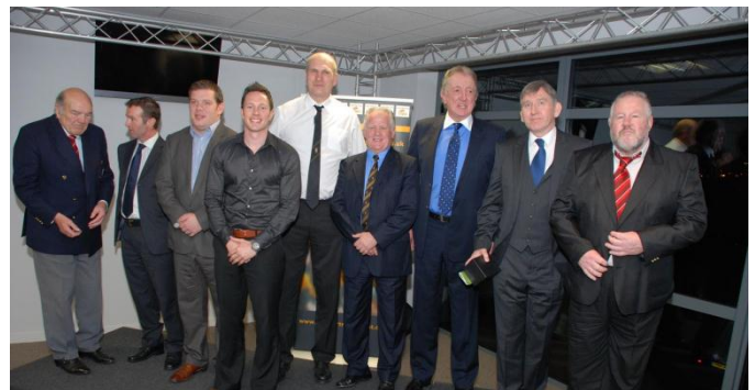
Some of the FoNR/Newport RFC inaugural Hall of Fame inductees